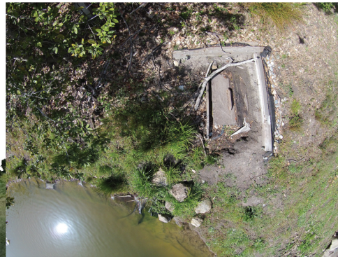
Aerial photo from UAV